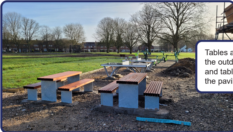
Tables and chairs, the outdoor gym and table tennis by the pavilion installed