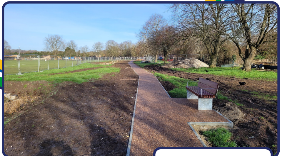
All furniture has been installed across the site