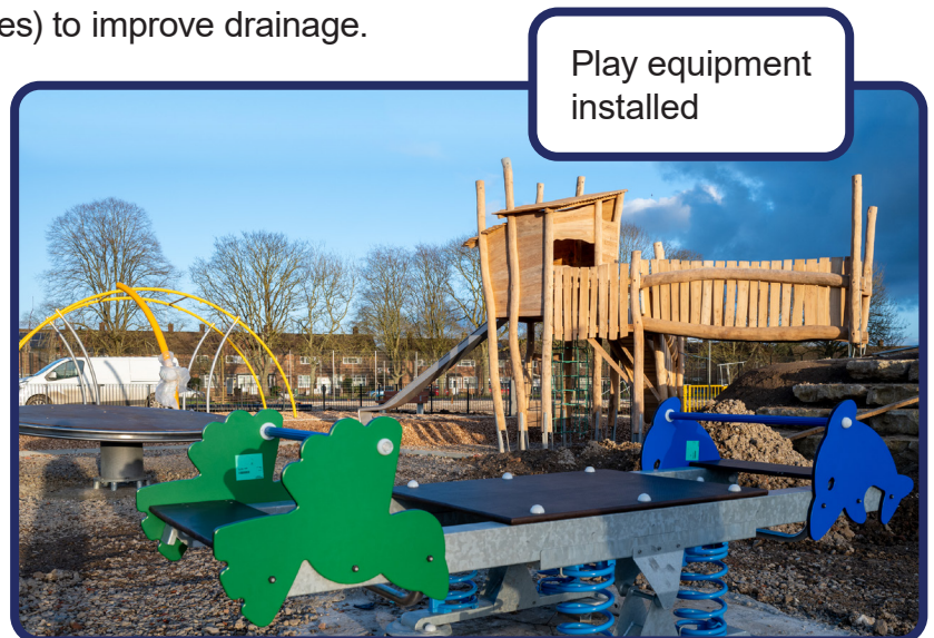
Play equipment installed

We expect all the main works will be completed and the Rec will re-open in mid-March. Because of the particularly wet weather conditions over the last couple of months, we may need to finish the water channel works a little later when it is drier, however this will not impact on the opening and use of the Rec.