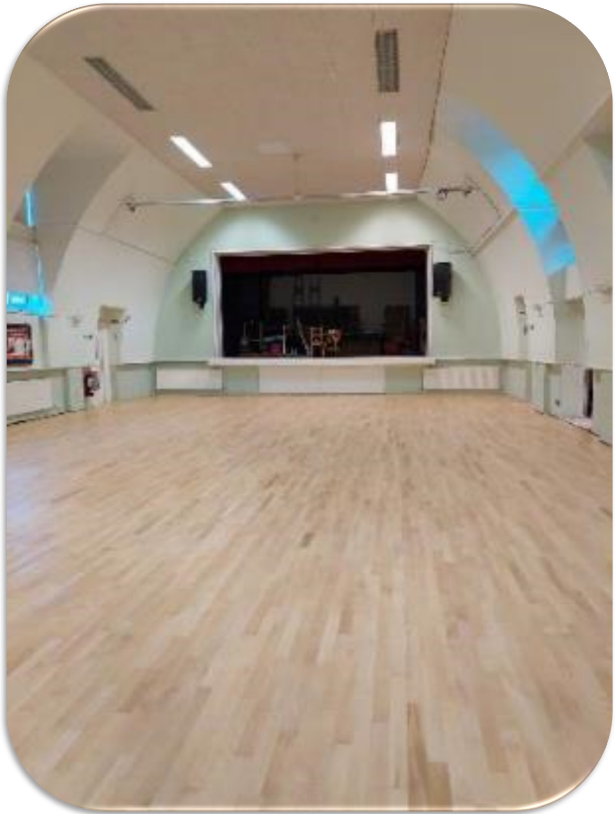
Figure 8: NW141 - To contribute to replacement and refurbishment of the floor surfaces at the Church Hall, Church of the Good Shepherd, Tadworth