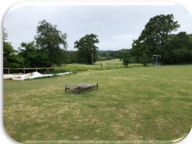
Figure 1: NE78 - To fund the replacement of perimeter fencing for cricket practice area & field at Merstham Cricket Club

4.7 Below are photographs of some of the projects that Local CIL was spent on in the Reported Year (1 April 2023 to 31 March 2024).