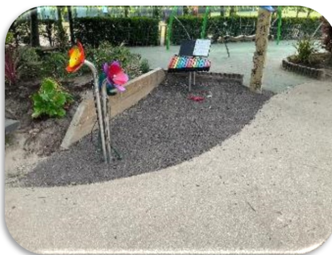
Figure 17: NW07– To fund the provision of outdoor gym equipment at Lady Neville Recreation Ground.