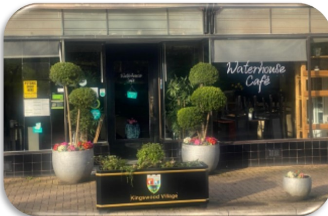
Figure 14: NE80 – To fund installation of four planters, plants and compost for Kingswood Village Parade