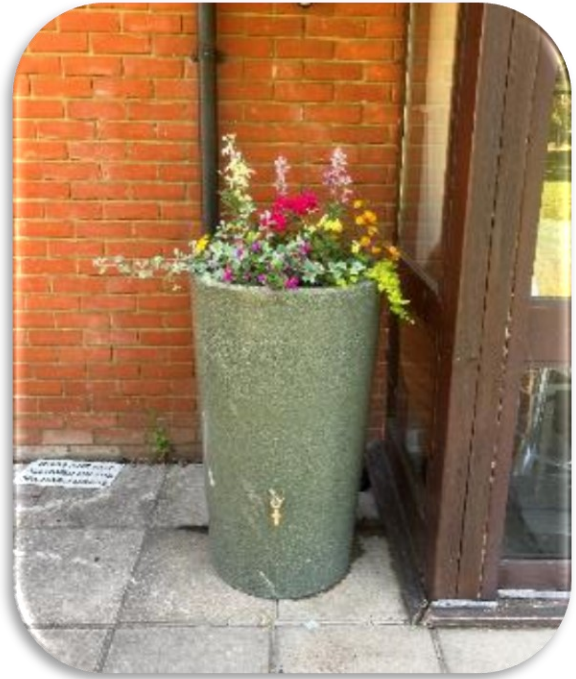
Figure 4: NW139- To fund a raised flowerbed to replace current ground level flowerbed at Memorial Roundabout, Banstead outside Cheyne Court.