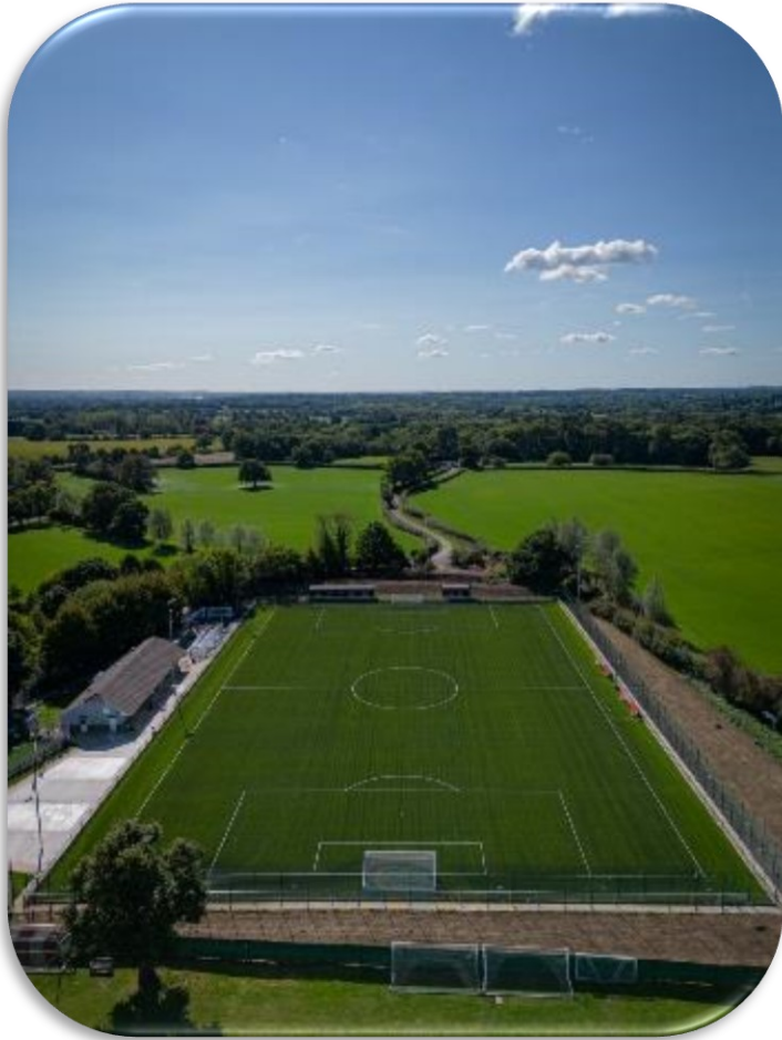
Figure 1: SIP(2)-69 - To fund (retrospectively) the purchase and installation of security fencing around the new 3G pitch and additional expanded car park at South Park Sports Association, Whitehall Lane, Reigate

Below are photographs of some of the projects that Strategic CIL was spent on in the Reported Year (1 April 2023 to 31 March 2024).