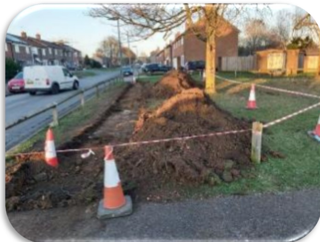
Figure 13: NW144 – To fund the creation of a tarmac footpath along Merland Rise grass verge at its junction with Preston Lane to improve pedestrian safety.