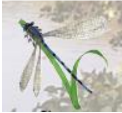
Common Blue Damselfly