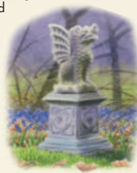
There be dragons at Upper Gatton Park...

9 Turn right onto the public bridleway and through a field. Before you reach the wood at the other side, turn left and follow the field edge (with the woodland on your right). At the corner of the field, cross the stile and follow the path through Upper Gatton Wood. (This woodland is a sea of blue in the spring – the bluebells indicate that there has been woodland here for at least 400 years.) Keep following the path straight on; ignore a path off to your right and cross a stile out into a field beside an old air-raid shelter. Walk through the parkland, following the woodland edge, passing another old air-raid shelter on your left.