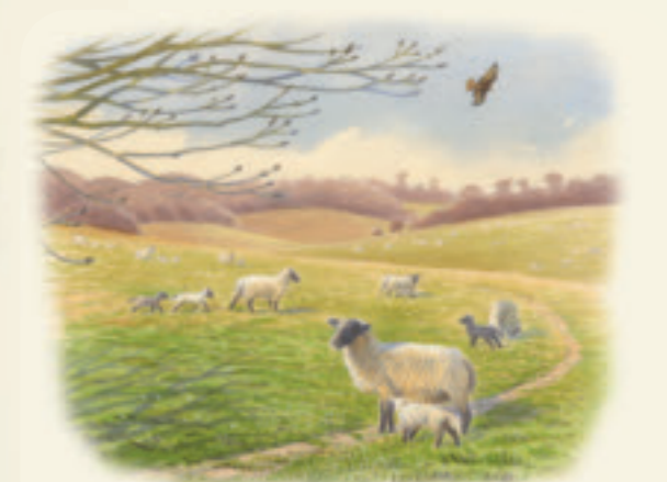
Shabden Valley & sheep

13 Go through the kissing gate and carry on downhill through the field towards a road. Bear left before the kissing gate and follow the permissive path around the field edge, uphill until you reach the corner of the field.