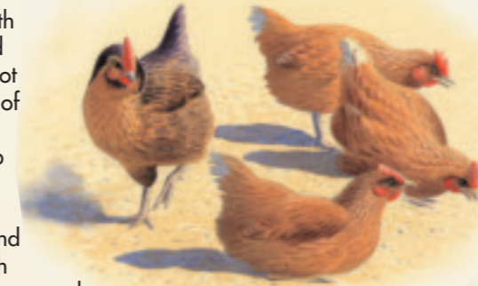
Chickens and cakes can be found at Fanny's Farm Shop

7 Turn right and follow the permissive path along the field edge (this is not a public right of way). Go through a gap in the hedgerow, cross a stile and follow the path between the fence and the hedgerow until you reach a gap in the hedge leading out onto Markedge Lane (so-called because it marks the parish boundary). Cross Markedge Lane and go straight on into the entrance to Fanny's Farm Shop.