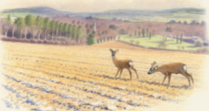
The view from Furzefield Shaw, at the top of Ashtead Hill

6 Cross the stile and follow the right hand field edge to a kissing gate. Go left then shortly right through another kissing gate and follow the path straight on with the hedge to your right. Go through another kissing gate and carry straight on until you come out into a large field with the M25 in front of you.